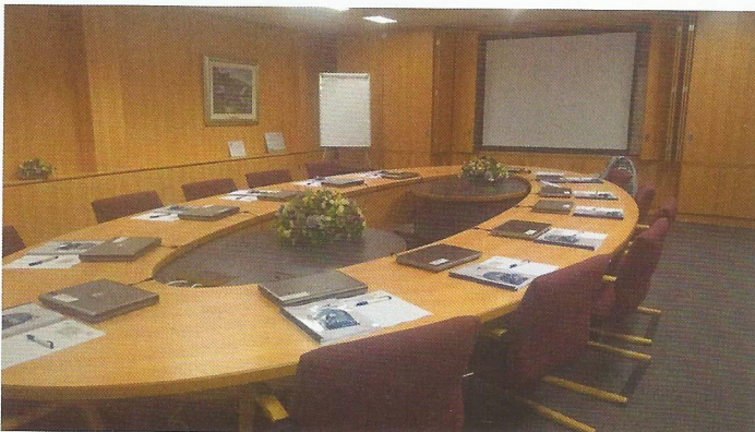
A typical set-up for a BRM workshop

This implies that the WSL is not standing in front of a whiteboard,